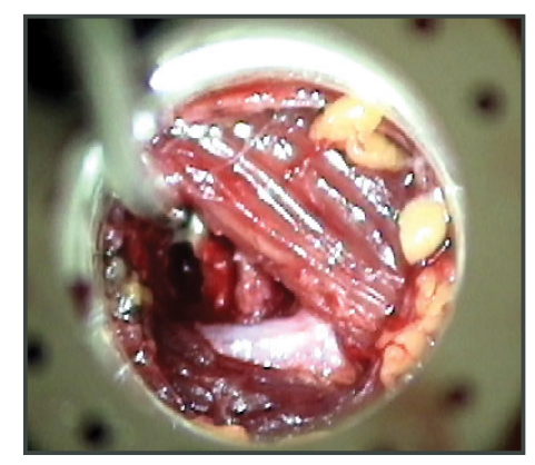
L4 nerve root under direct visualization