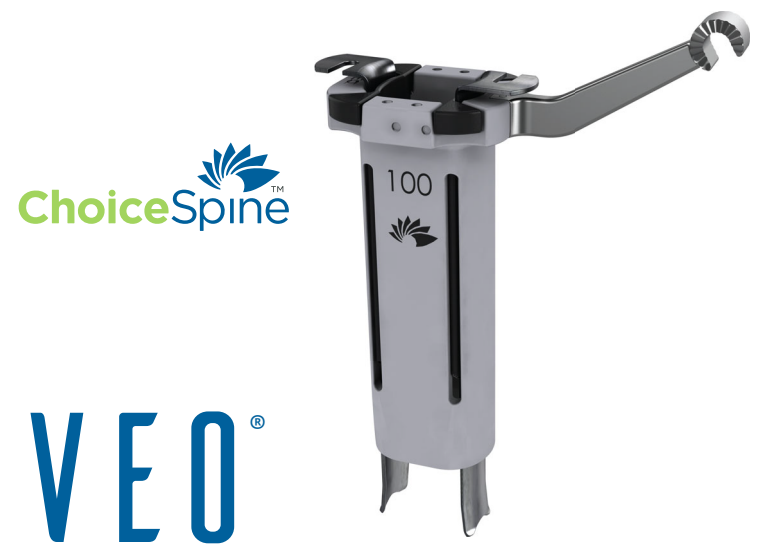
Lateral Access System

The Veo® Lateral Access and Interbody Fusion System is specifically designed for direct visualization of the psoas and associated nerves.